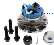
INTEGRATED IMPULSE WHEEL & ABS SENSOR