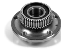
PASSIVE IMPULSE WHEEL LOCATED ON WHEEL END

*This type of impulse wheel is difficult to identify with the naked eye and requires special care when handling and installing. Check MOOG ESB "Wheel End Bearings with integrated magnetic ABS impulse wheels" for more information