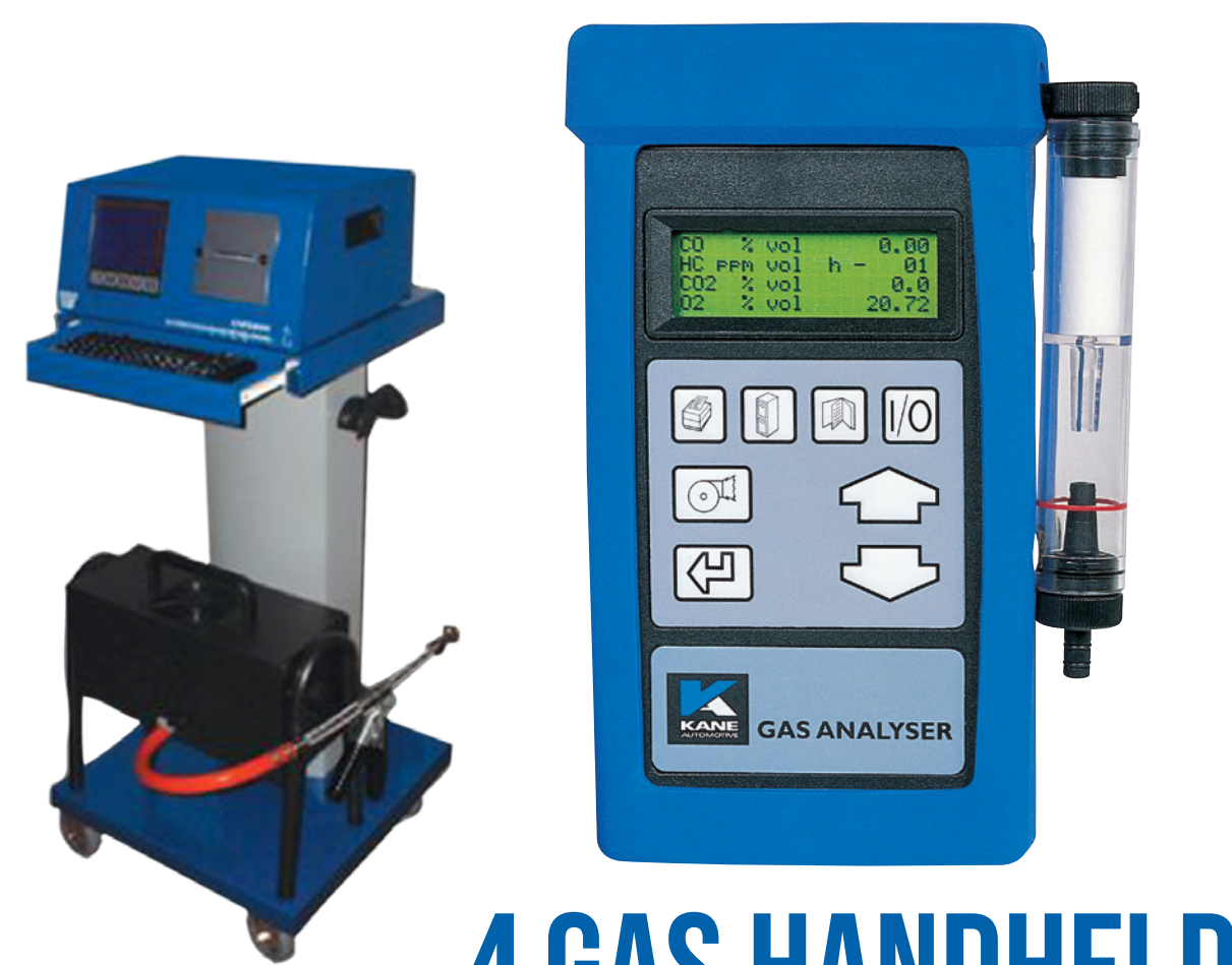
4 GAS HANDHELD