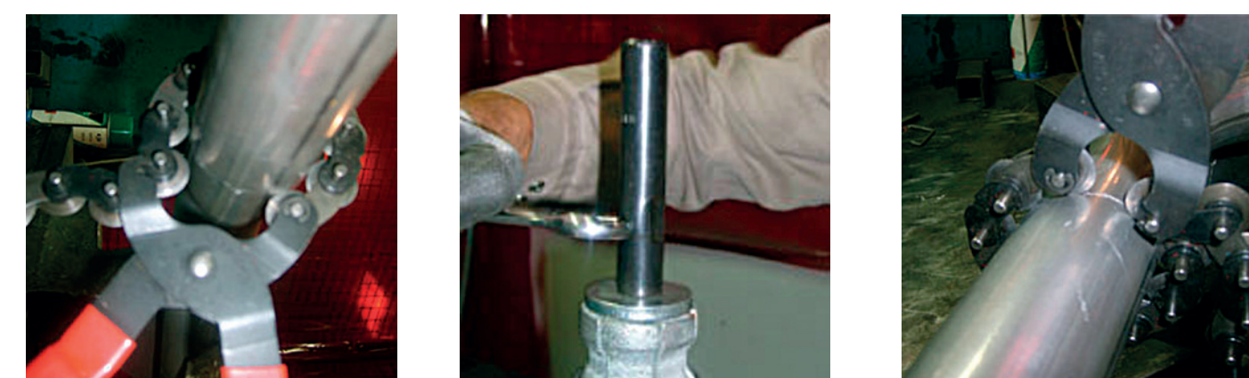
HOW TO USE PIPE CUTTERS / CYLINDRICAL EXPANDERS / CONICAL EXPANDERS