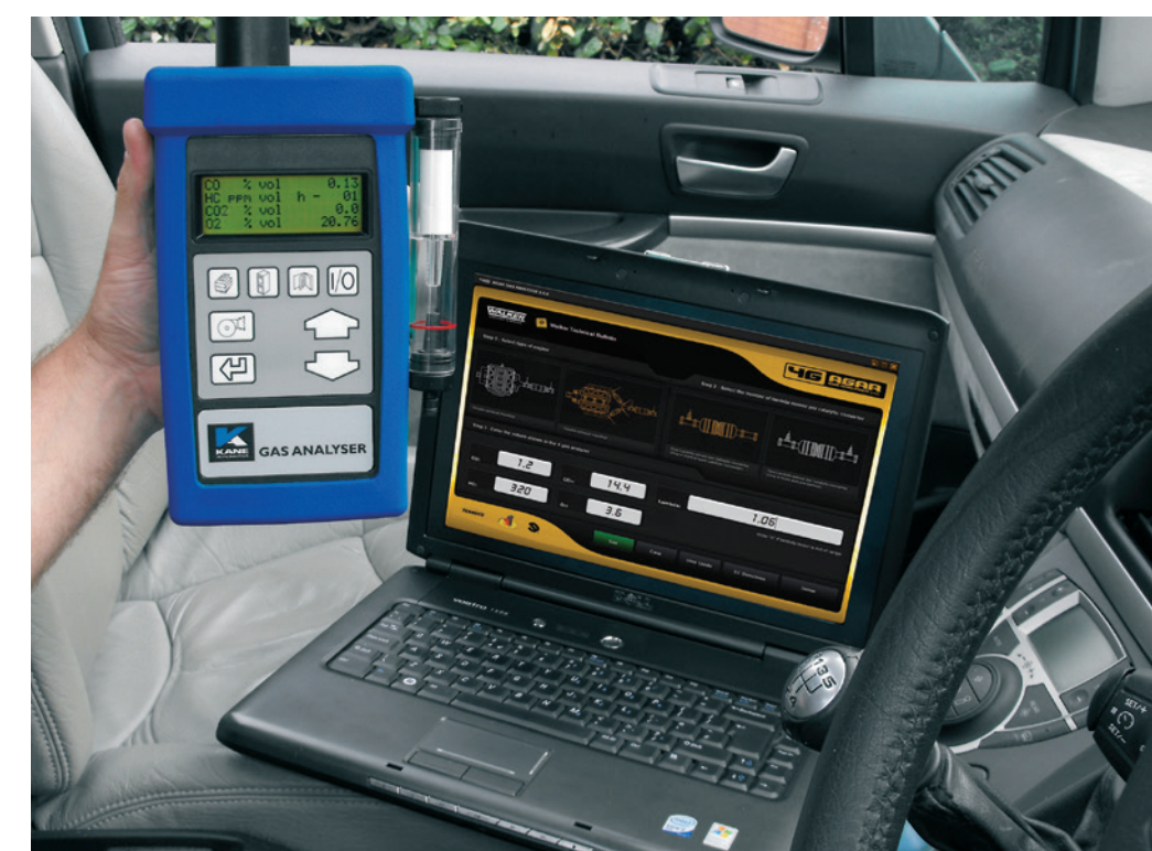
4 GAS ANALYSER