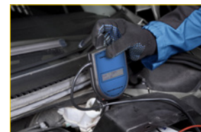
BRAKE FLUID TESTER

In cases where customers require totally accurate water content, Jurid can determine it by using industry standard techniques such as the well-known Karl Fisher method for water content.