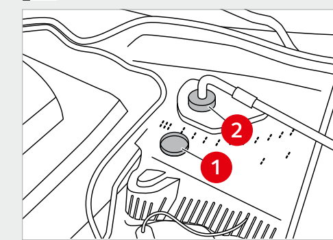
BLEED KIT ASSEMBLY